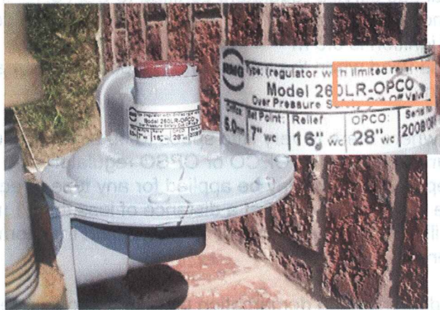
Photo B7 – Typical demarcation point between Gas Company and customer house line